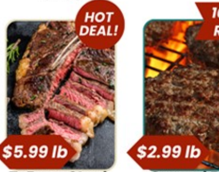
T-Bone Steak Sukarne T-Bone Steak