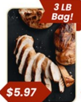
Chicken Breast Tenderbird IQF Chicken Breast 3 LB Baa