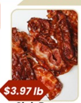
Slab Bacon Country Style Family Pack Bacon