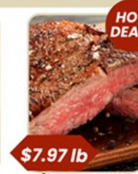
Ribeye Steak Whole Sukarne Ribeye