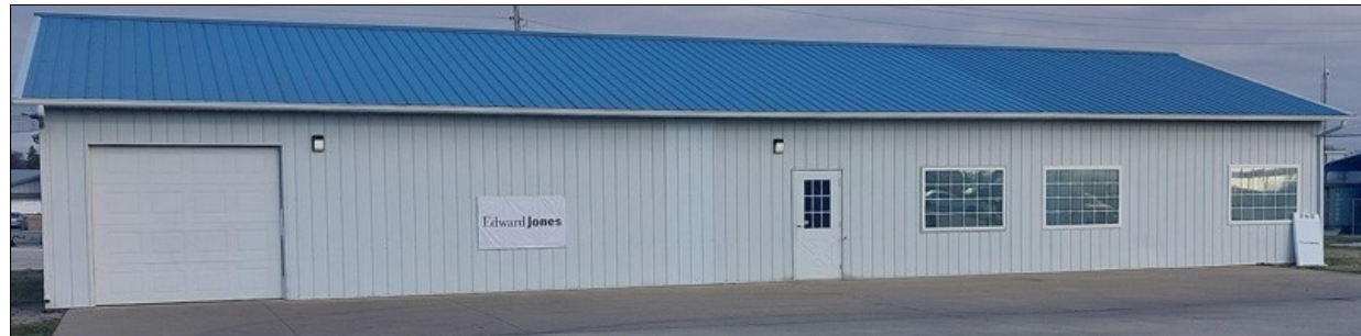
Hoopeston's Edward Jones office has temporarily moved to 1006 W. Chestnut after its downtown office was condemned.