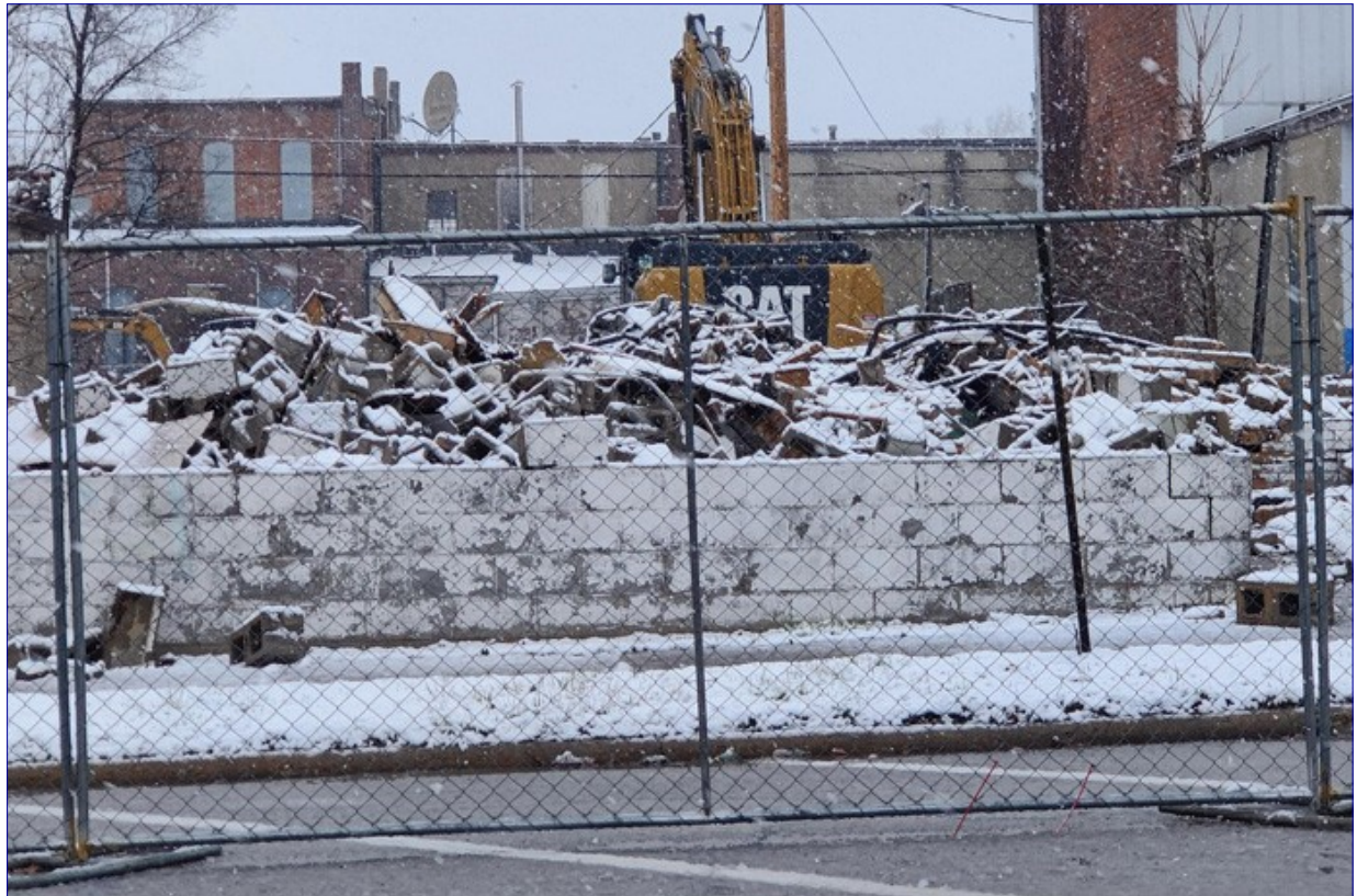
One down The former Hoopeston Food Locker is the first of several buildings in downtown Hoopeston to be razed. The locker was demolished last week. Work is expected to begin again this week, as several buildings on Main St. and a couple on Market are reduced to rubble.

the accident, on Rt. 9, west of 1300 East Rd. Armstrong, in a 2000 Chevrolet Monte Carlo, left the roadway on the southbound side, lost control in the snow and slush, struck an embankment, and over- See CRASH on other side