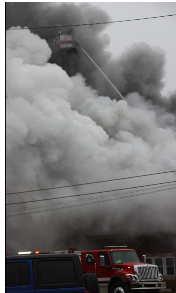
Smoke envelops a Hoopeston firefighter as he sprays water from the department's aerial truck during Tuesday's fire at the former Firestone building 215 N. Dixie Hwy.