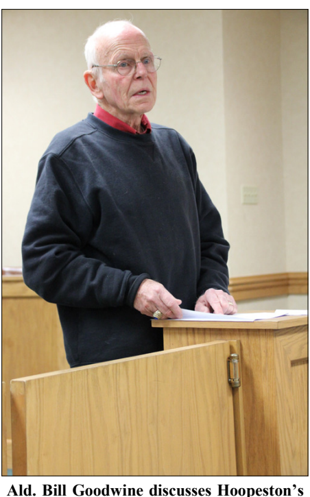
tax increment financing (TIF) districts at and 9, including McDonald's, the a Joint Review Board meeting Wednes-