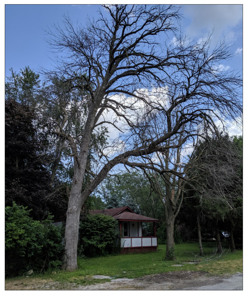
Dead and dying trees, like these pictured, are potential problems in Hoopeston. Officials estimate there are a minimum of 240 such trees but are asking help from residents to compile a more complete list.