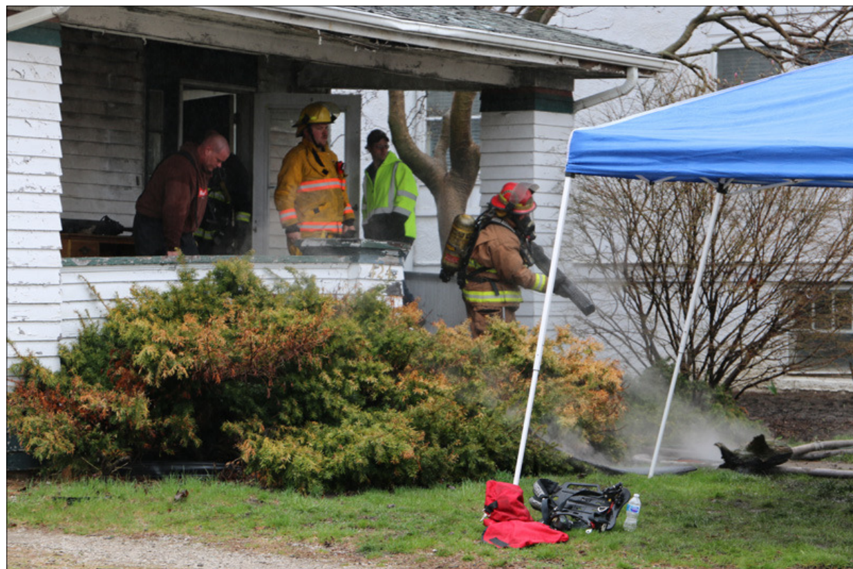
Area firemen hold training practice Sunday at an abandoned house at 426 E. Main, Hoopeston.