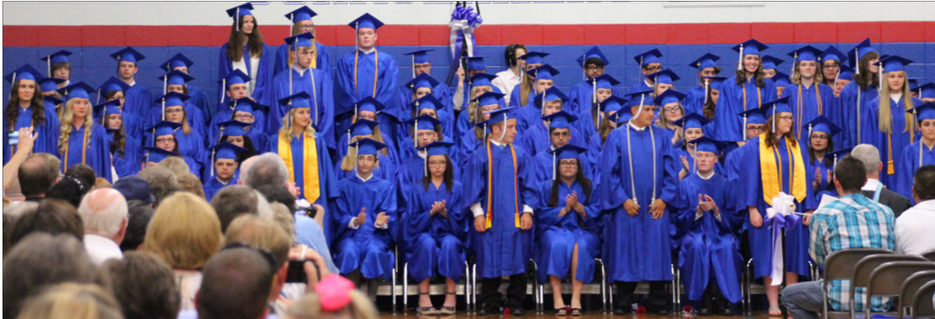
Graduates who achieved academic excellence during their time at Hoopeston Area High School are recognized at Sunday's graduation ceremony. Those who achieved the goal are noted in the list of graduates below.