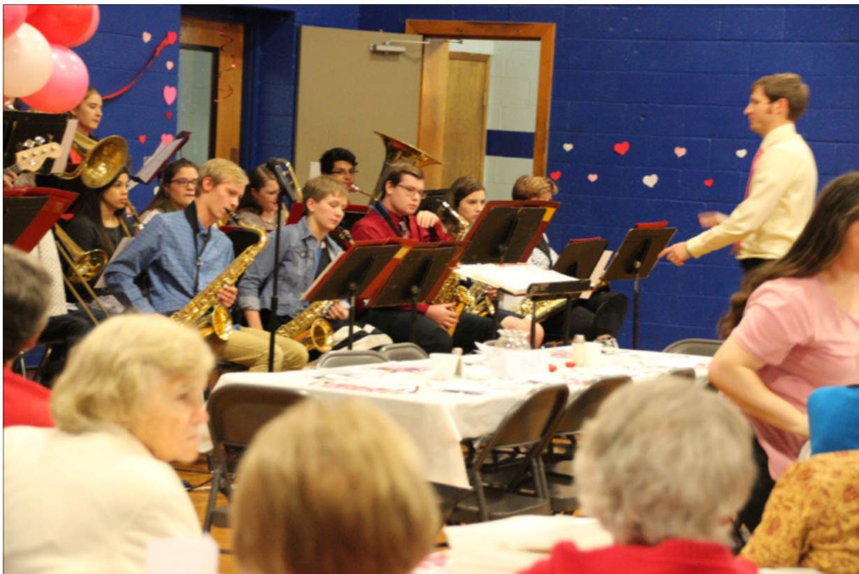
Area senior citizens enjoy music by the Hoopeston Area High School jazz band at Friday's 26th annual Senior Citizen Sweetheart Dinner, sponsored by the school's Student Council.