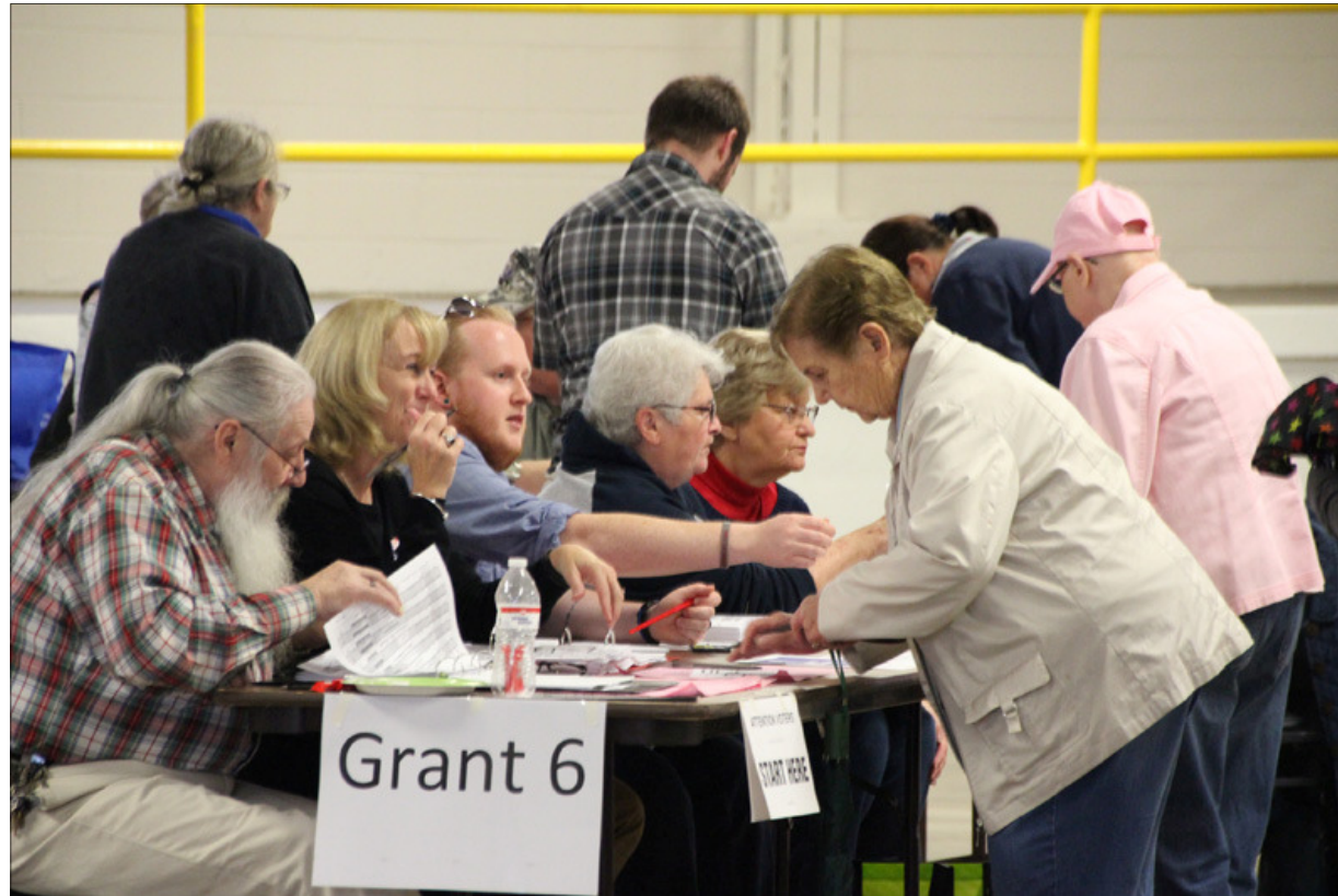
Voters keep Grant Township election judges busy at polling Tuesday at McFerren Park Civic Center.