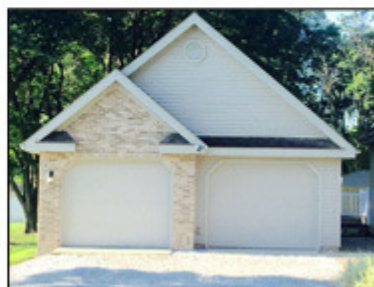
Info here deemed reliable but not guaranteed.

Another quality project by Ervin Construction Hoopeston, IL