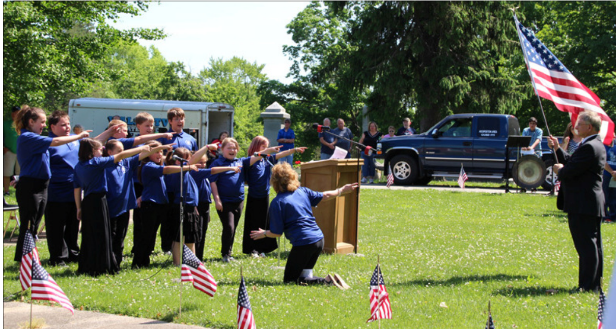
Members of the Hoopeston Community Children's Choir perform at the Memorial Day ceremony at Floral Hill Cemetery. The choir will hold auditions/rehearsal for the new season at 4 p.m. August 10 at First Christian Church.