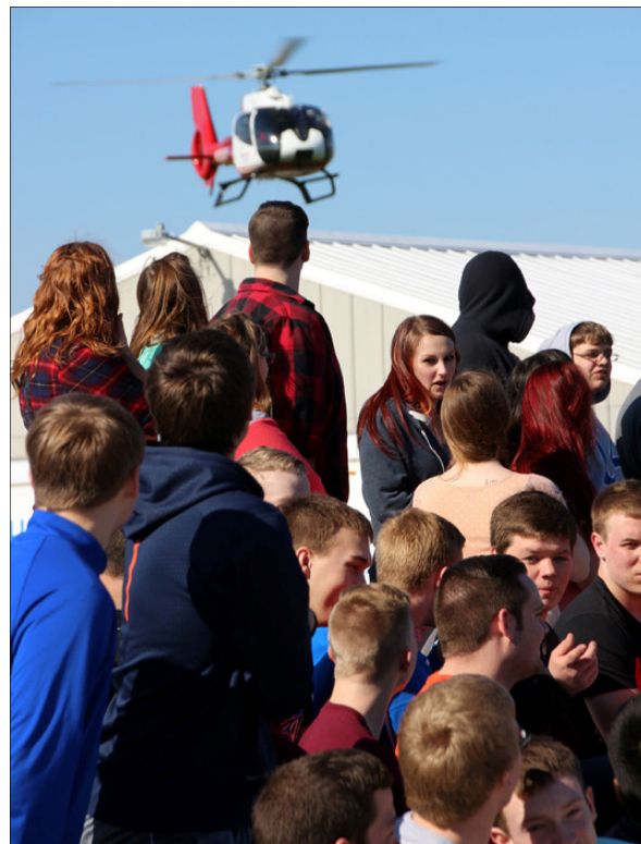
Hoopeston Area High School students watch as an Air Life helicopter lands at the school Friday as part of a mock crash drill.