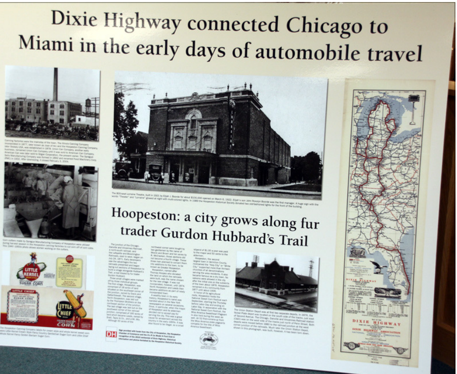
A sign commemorating the centennial anniversary of the Dixie Highway was displayed at the September 15 Hoopeston City Council meeting. A dedication ceremony will be held on October 9.

The Dixie Highway was America's first north-south "interstate," linking Chicago with Miami. In Illinois, the historic route of the highway travels south on Michigan Ave., from the Art Institute to Garfield Boulevard (55th Street), then west to Western Ave. The highway then