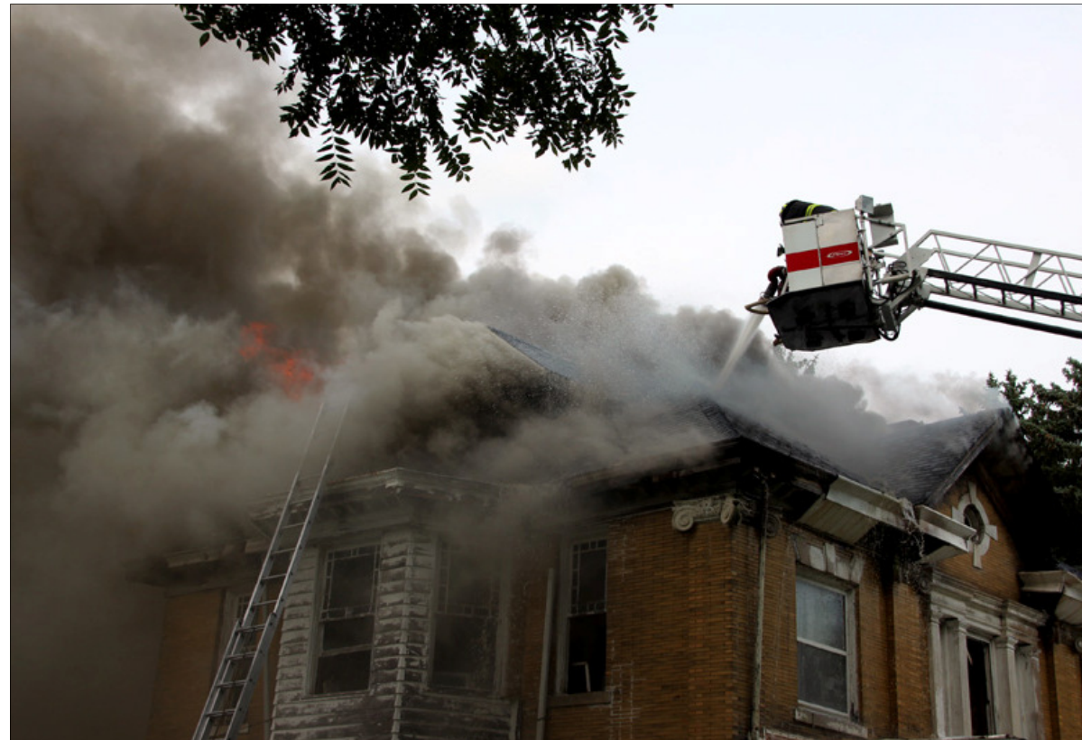
As Hoopeston firemen drench the south side of the former Dyer House, flames shoot from windows on the west side. Several departments responded to the structure fire, which appears to have been intentionally set.