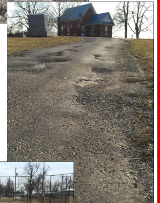
Floral Hill Cemetery Road