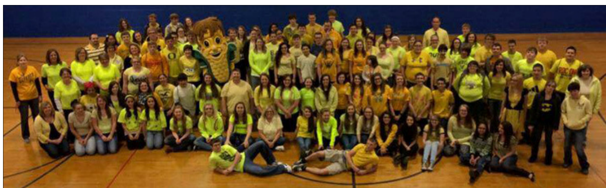
Hoopeston Area High School students wear yellow in a "#WearYellowForSeth," an online campaign for a boy whose autoimmune disease keeps him isolated.