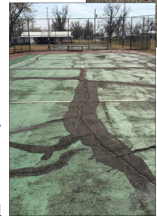
McFerren Park Tennis Courts