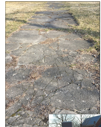
North Side Park Sidewalk