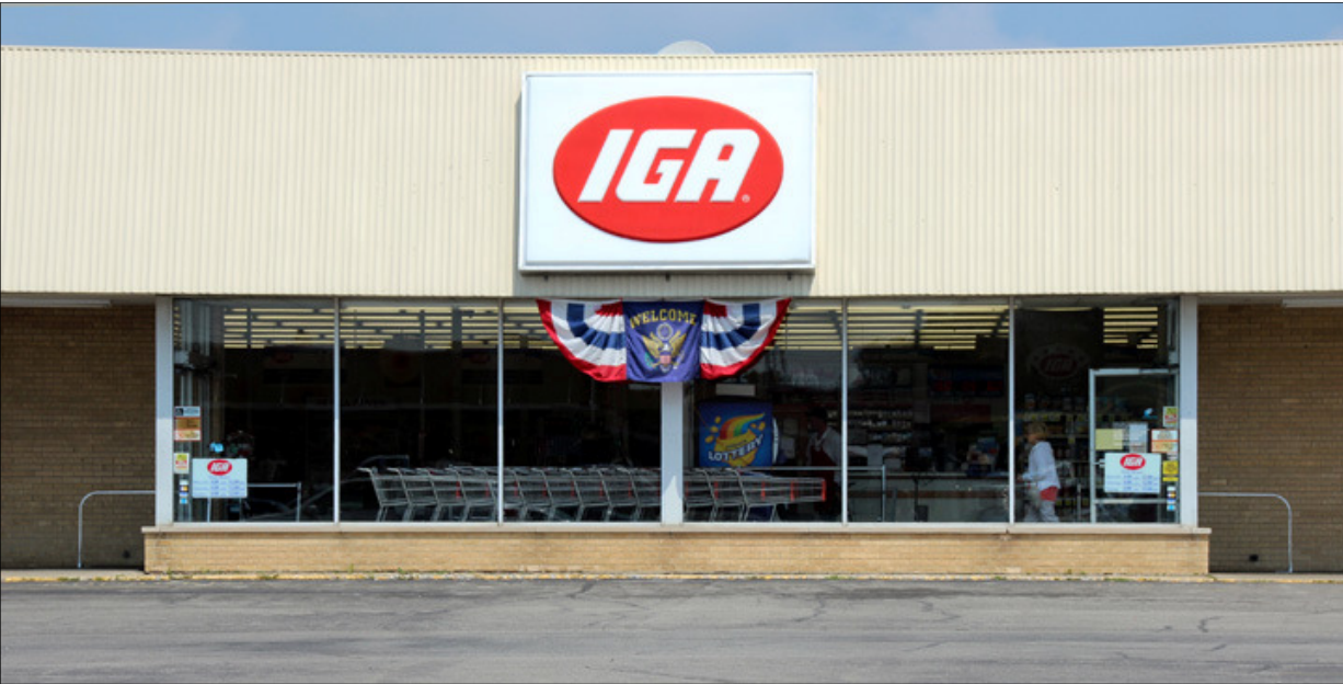
Hoopeston IGA’s storefront, shown here, will be getting a facelift, along with other improvements. Work is expected to begin this week and be completed in March 2015.

will have to become accustomed to a new product layout. For example, bread will be moved to the last aisle so it will be the last thing in the cart, not among the first.