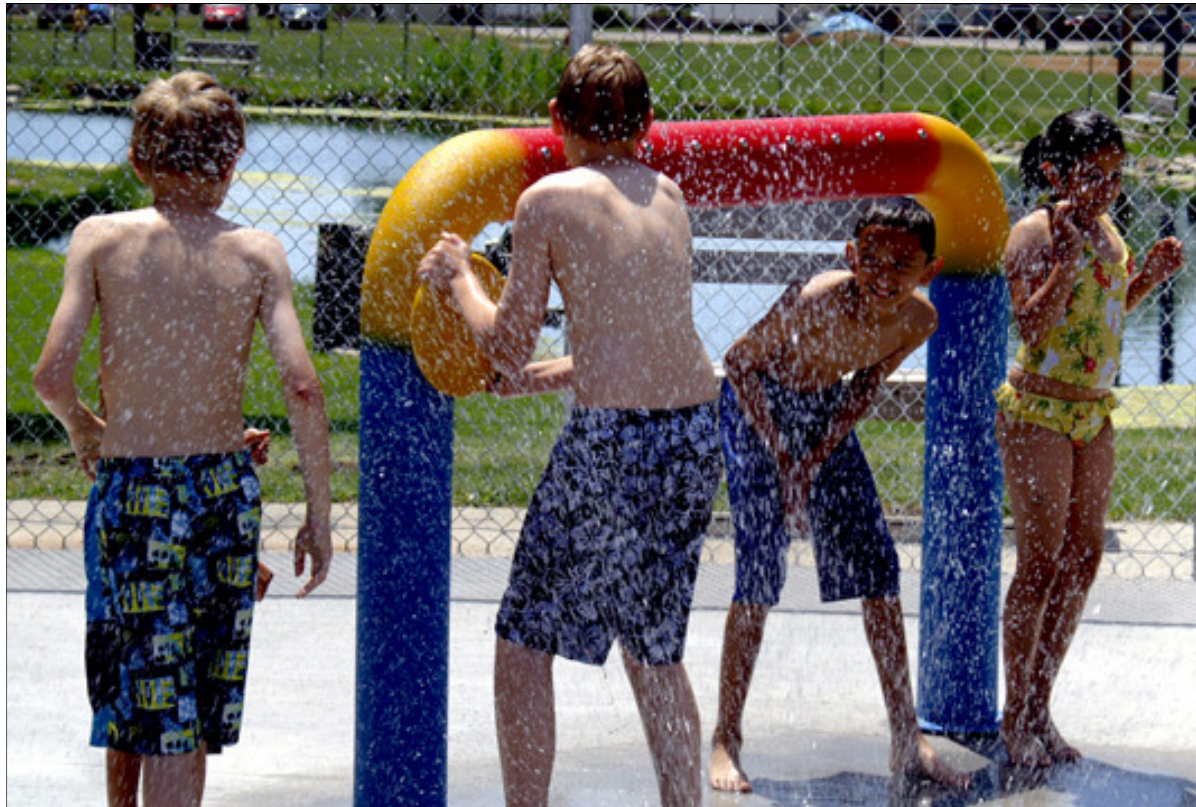
Local youngsters cool off Saturday at the new splash pad at Hoopeston Swimming Pool.