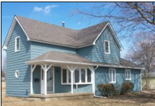
822 S. Second Ave., Hoopeston Corner of Route 9 (Orange) and 2nd Ave.