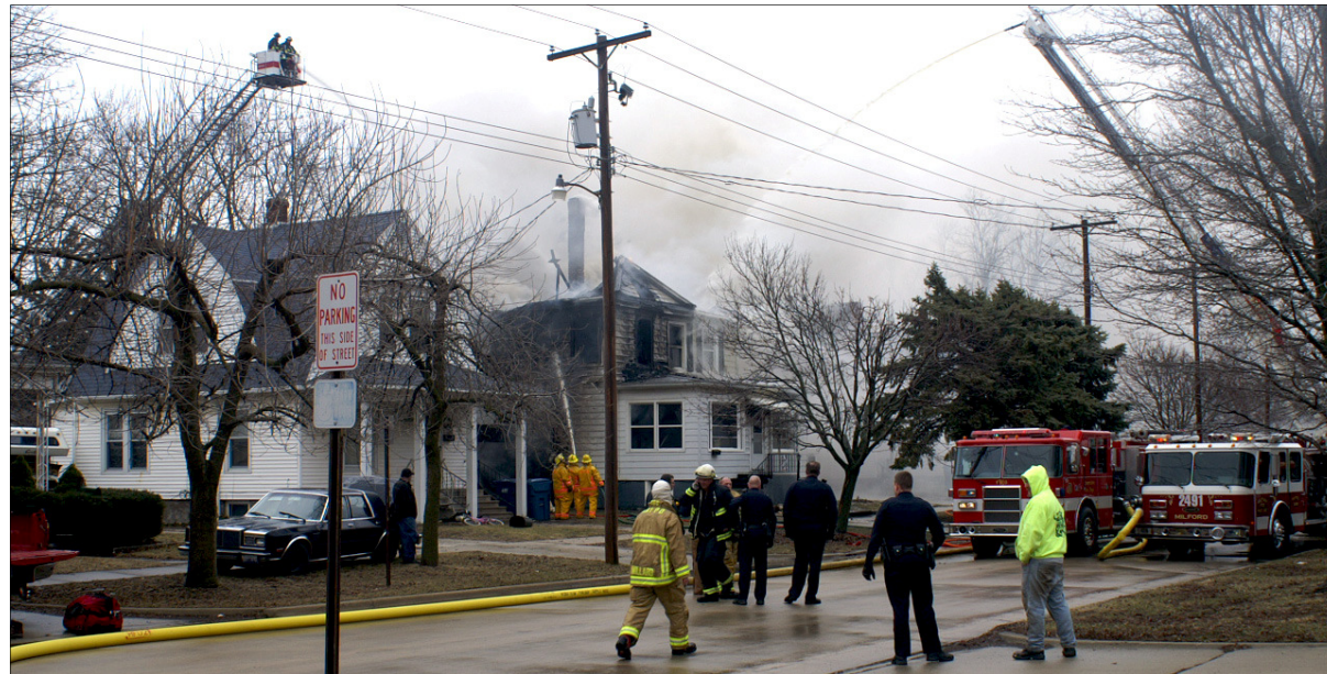
Hoopeston and Milford aerial trucks douse a fire Thursday afternoon at 715 S. Fifth St. Firemen from several area departments responded to the blaze in the apartment house.