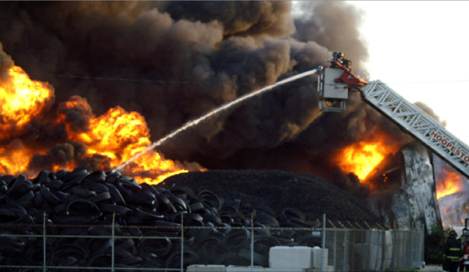
Hoopeston firemen man the aerial truck in an effort to beat back a fire at J&R Tire Recycling in the former FMC Building on Route 9. Firemen fought the building on multiple sides from Route 9 to Maple and were assisted by at least 11 other departments and several area businesses who helped haul water to refill tanker trucks at the scene.