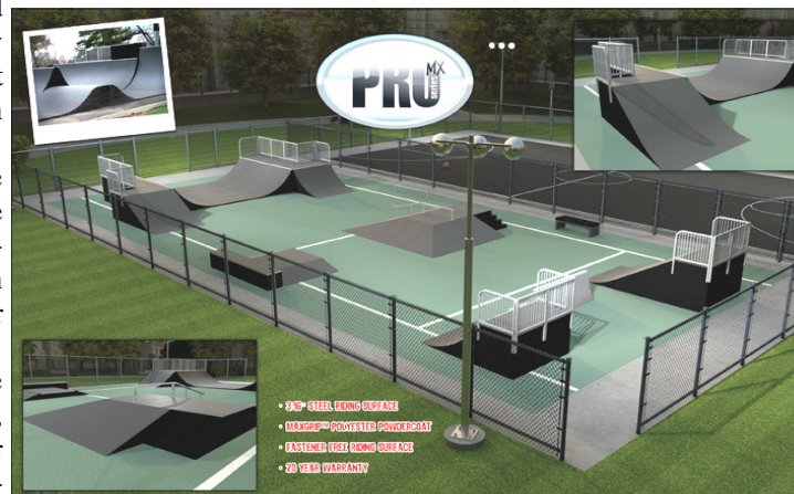
Above, skateboard designs for Cheese Park. The top photo shows a standard $25,000 design from American Ramp Company. The bottom photo shows a $100,000 design created specifically for Cheese Park.

While the group would like the $4,000 already donated, after the meeting, Ferrell said the group expects no money from the city and plans to raise funds through various activities and applying for grants from the Tony