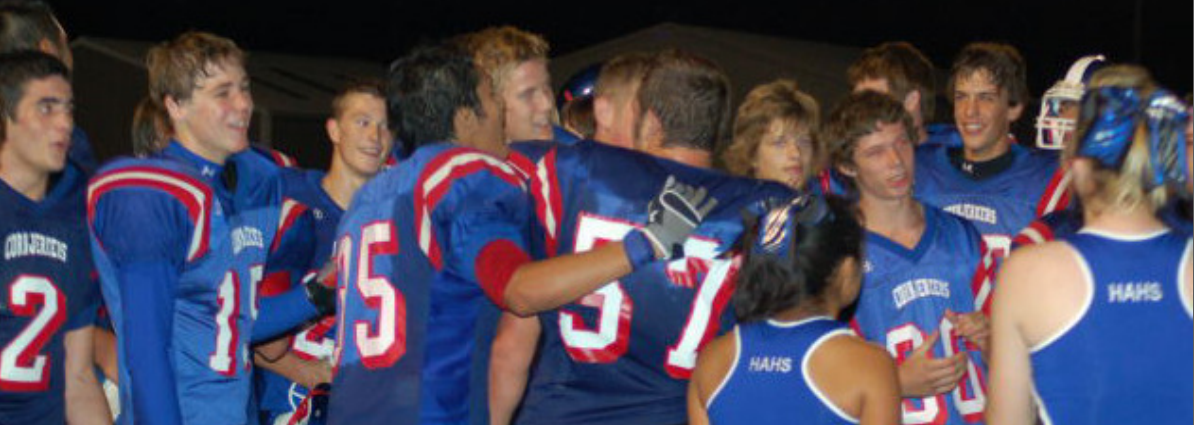
Hoopeston Area Cornjerkers celebrate after their first win of the season Friday against Georgetown-Ridge

Cornjerkers a 14-10 lead going into the second half.