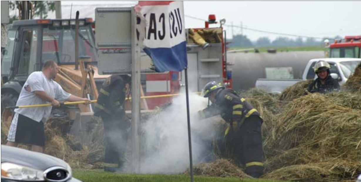
Hoopeston Fire Department, with mutual aid from Rossville and Wellington-Greer departments, fought simultaneous fires Sunday afternoon. Called to Routes 1 and 9 for a rack of hay on fire, the department was then called to 510 W. Washington for a garage on fire.