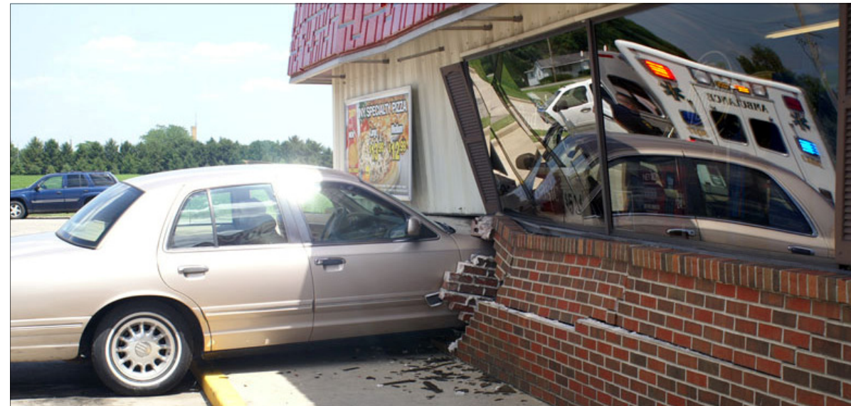
No one was injured when a 1997 Mercury went through the wall of Casey's General Store, 115 E. Orange, Friday afternoon. Right, damage caused on the store's interior by the accident.