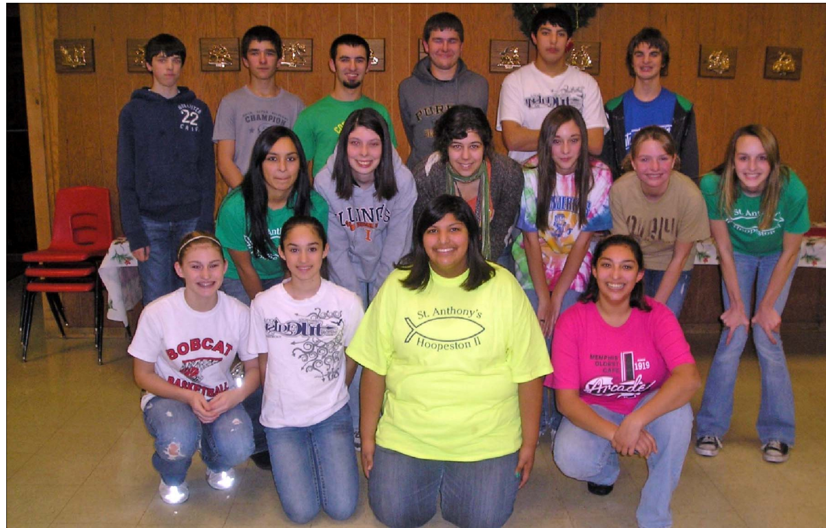
This year's volunteers for the St. Anthony Youth Group mission trip to Memphis Tenn.