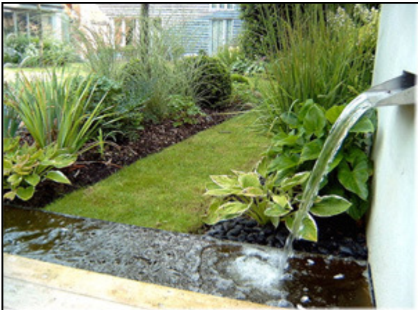
Make the outside of your home as beautiful as the inside!

T & L Lawn Care Landscaping Patios Mowing Service