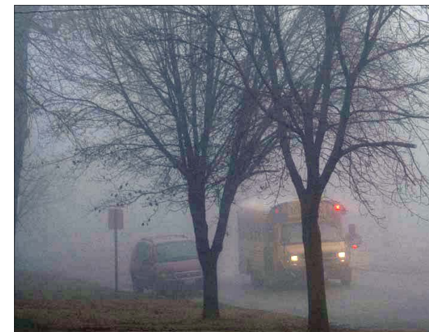
Pea soup A Head Start bus waits for a student in thick fog Monday. The area was under a dense fog advisory until 11 a.m. Monday.

Showers likely today, tonight and tomorrow. High 54, low 43. Tomorrow, high 56, low 48. For current weather conditions, call Hoopeston Weather Service, (217) 283-6221.