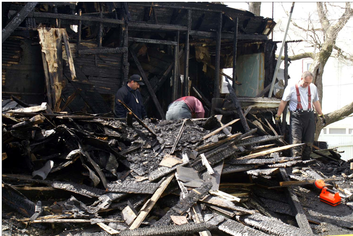
An Illinois State Fire Marshall and Hoopeston firemen sort through rubble in the aftermath of a fire early Sunday at 406 E. Main.