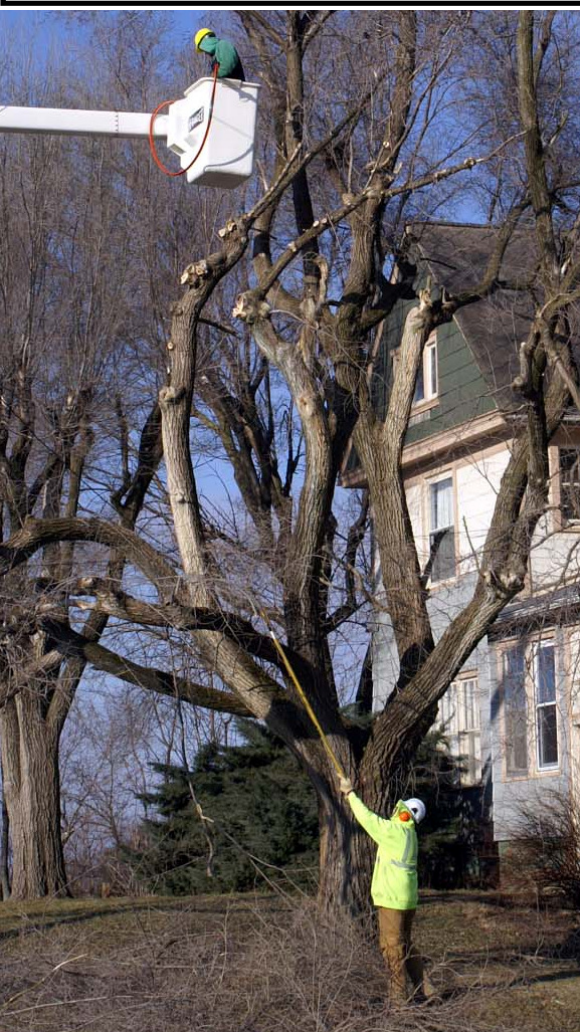
Tim-brrrr Employees of Wright's Tree Service trim a tree in the 1000 block of East Thompson. Workers have been trimming trees along power lines for several days.