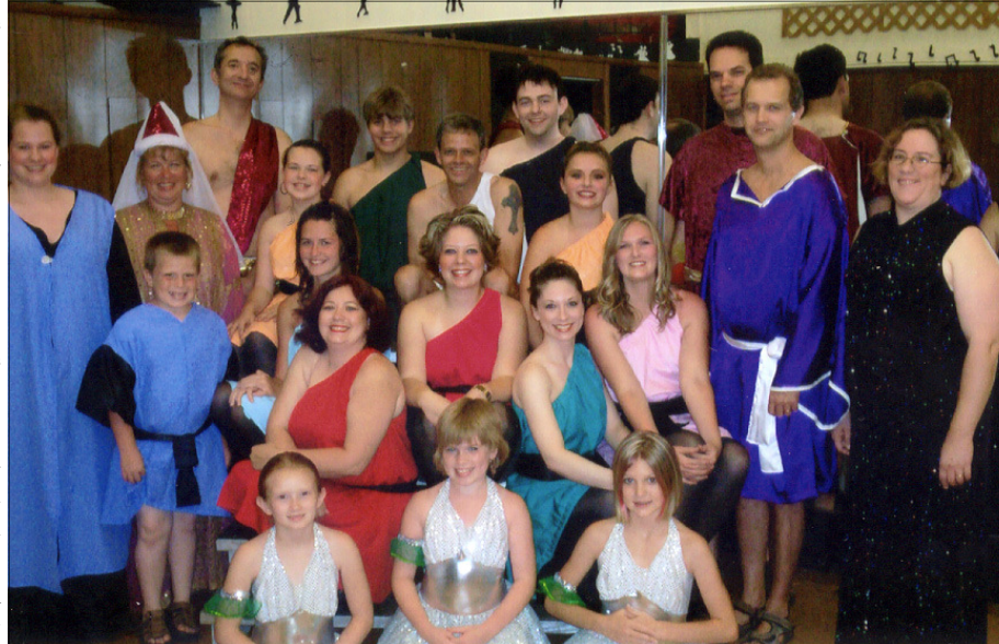
The cast of "Pippin"

Although the story takes place long ago, the message is true for people in all times and places. Pippin finds his way to a full, happy and successful life in the simple truths of life.