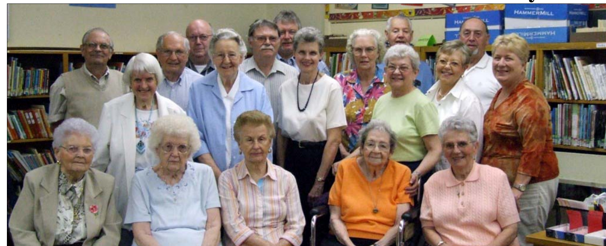
Hoopeston Area School District retired teachers