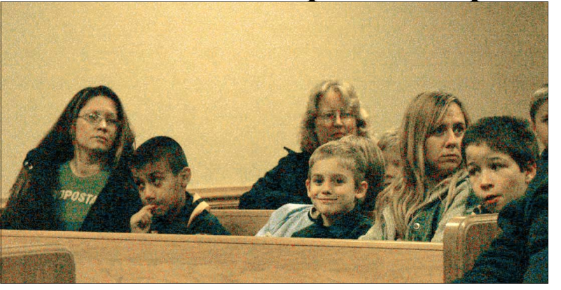
A comprehensive plan would provide Members of Den 3 Pack 118 of the Hoopeston Boy Scouts learn about government at Tuesday's Hoopeston City Council meeting.

Is your computer crashing regularly, or worse, won't boot up at all? Is it making strange noises that keep you up at night with worry? Don't worry—Computer Works will come to your aid. We service all makes and models of computers, will do upgrades, or can custom build a new one, to fit your needs. New & Used products available. Bring your computer to Computer Works, the 303B E Main, Hoopeston, for a free estimate, or give Teresa a call at 217-283-9552. Cooketech wireless also available.