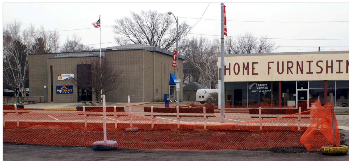
City workers this week took out dead trees from the parking lot in the 300 block of East Main. The area is to be resurfaced, said Mayor Bill DeWitt.