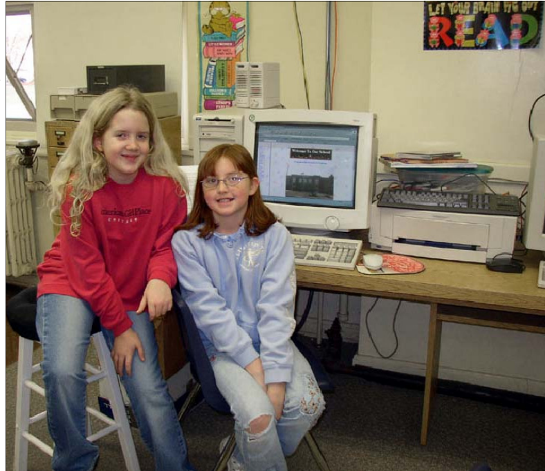
Fourth grade typing students take a break from their duties. They are just two of the students who are compiling a book on early Honeywell students and their memories of the school.