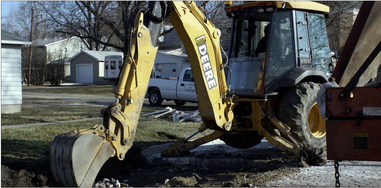
Sinking in Hoopeston city employee Wade Gocking uses a backhoe to fill rocks in a hole in the 300 block of East Lincoln Wednesday. The street was closed while repairs were being made.