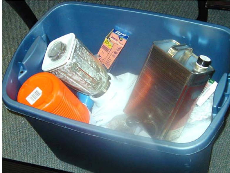
The makings of a meth lab, including a blender, aluminum foil, starter fluid and a plastic container were displayed at Monday's Hoopeston Neighborhood Watch meeting.

Despite the dangers of the drug, more and more people are becoming addicted and addicts find it nearly impossible to quit. "You don't stop cold turkey