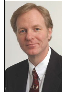
Paid political ad

heard the facts surrounding this issue, and take the facts, and not the misinformation or half-truths, and make a decision on how to vote. Please remember that this is all about the kids and the education they will receive in the future.