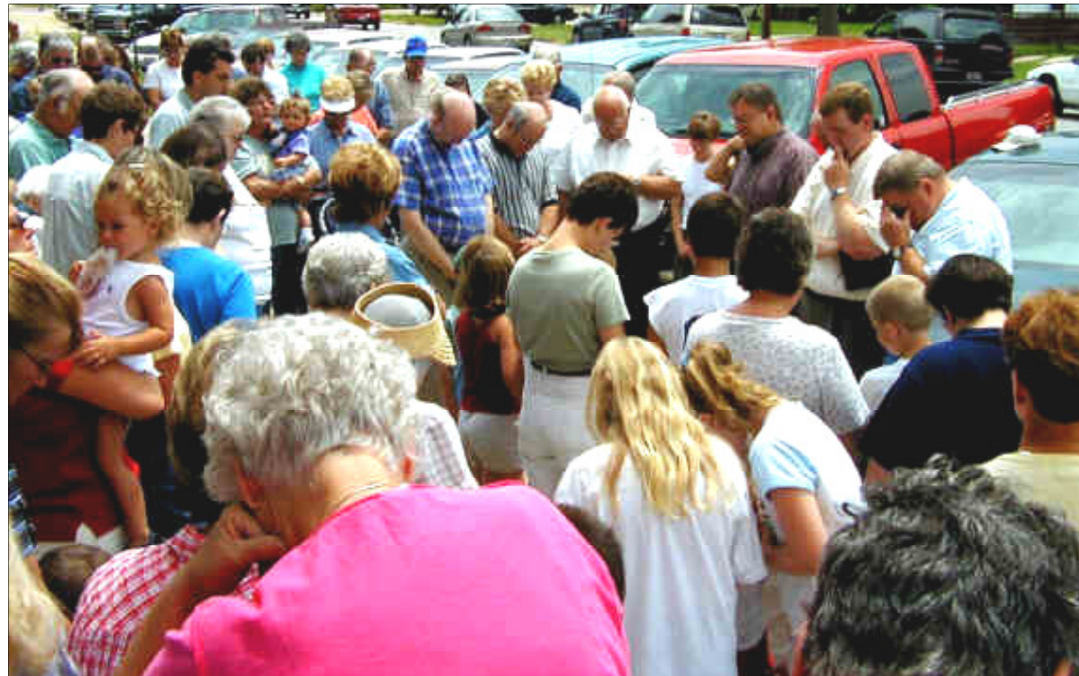
Area people gather Monday to pray at the planned site of a witch school in Hoopeston. More than 100 people attended the rally to pray that God not allow the school to open in the city.