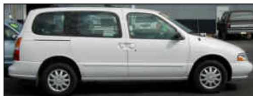
2000 Mercury Villager GS