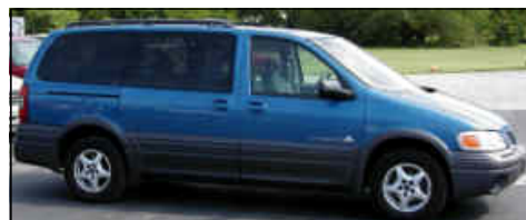
1999 Pontiac Montana