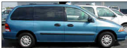
2002 Ford Windstar LX $17,995