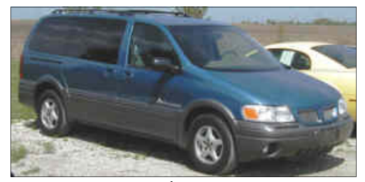
Only $11,888 Plenty of room for family & fun. This one will sell fast!