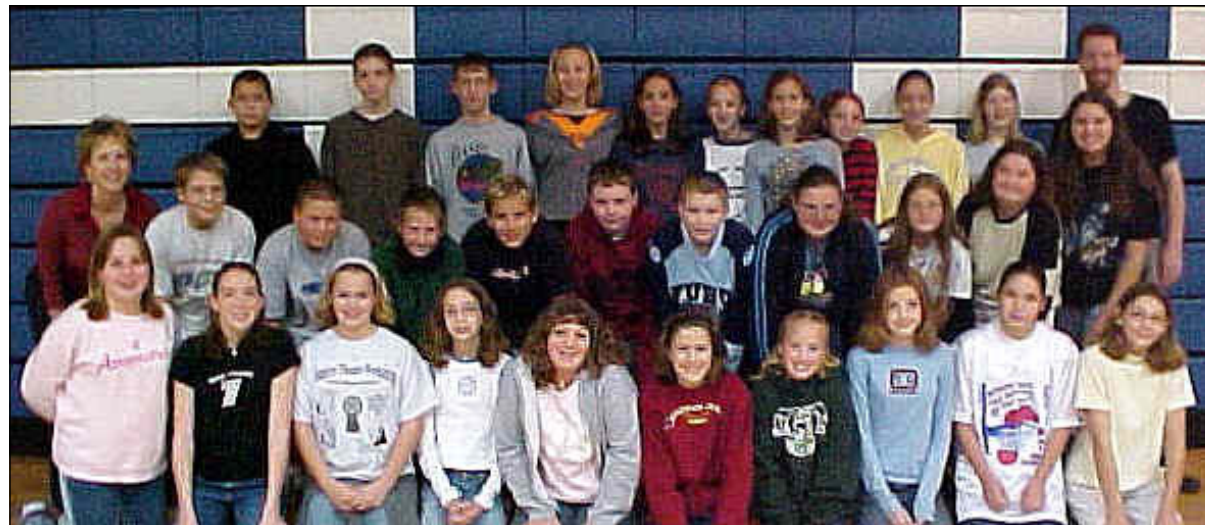
The cast and crew of "Meet the Creeps," which will be presented by the Hoopeston Area Middle School drama department Friday and Saturday.