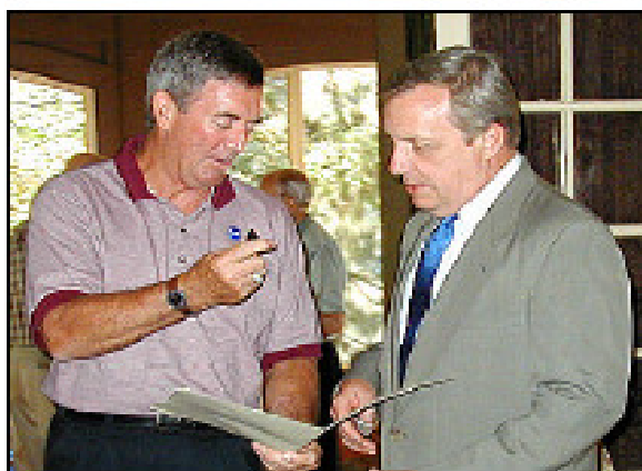
Sen. Dick Durbin discusses issues with a supporter Wednesday.

During the press conference, Durbin addressed health