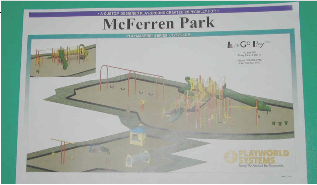
A drawing shows the planned playground layout at McFerren Park.

Mostly cloudy, chance of showers, thunderstorms today and tonight. High 74, low 57. Tomorrow, partly sunny. High 72, low 58. For current weather conditions, call the Hoopeston Weather Line at (217) 283-6221.