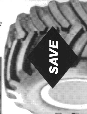
Super All Traction 23"