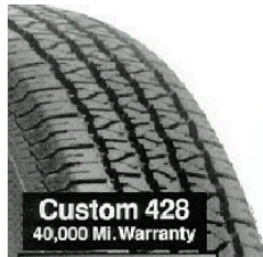
Custom 428 40,000 Mi. Warranty