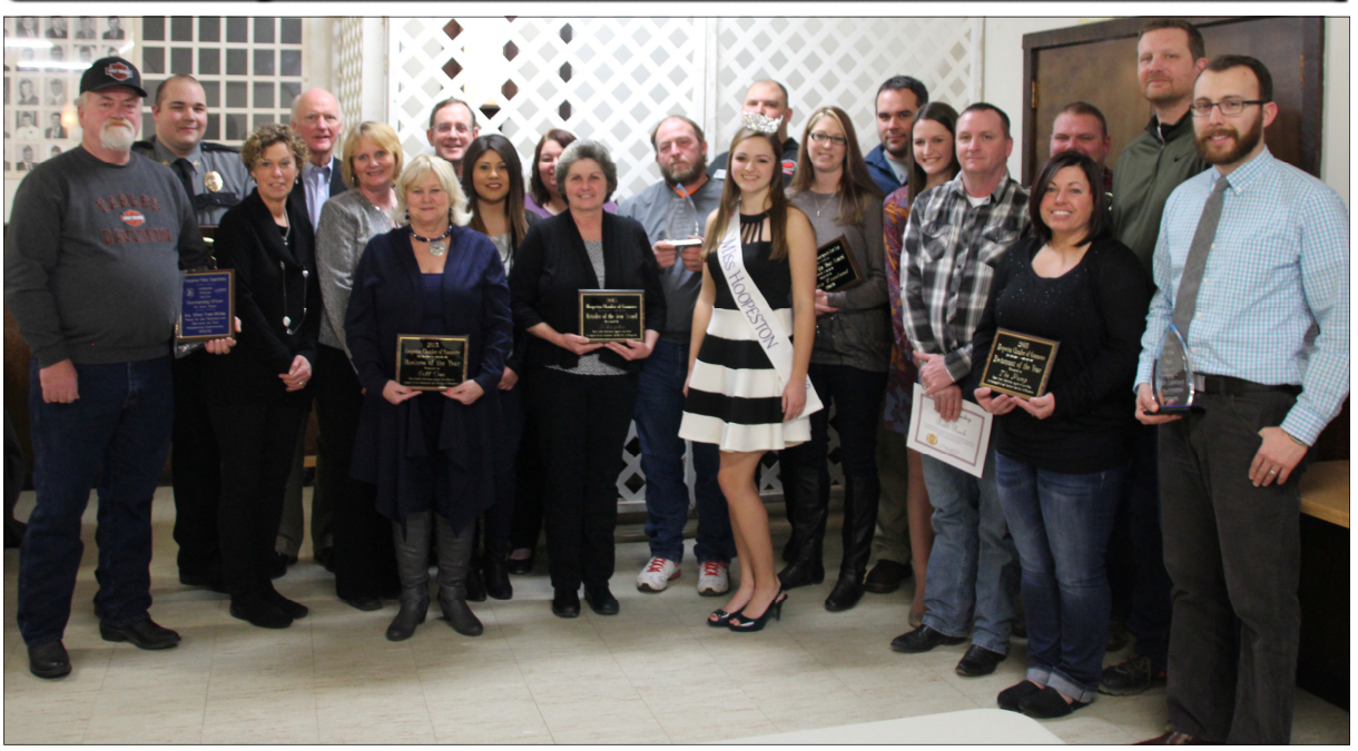
Winners named during Sunday afternoon's Hoopeston Community Awards Banquet