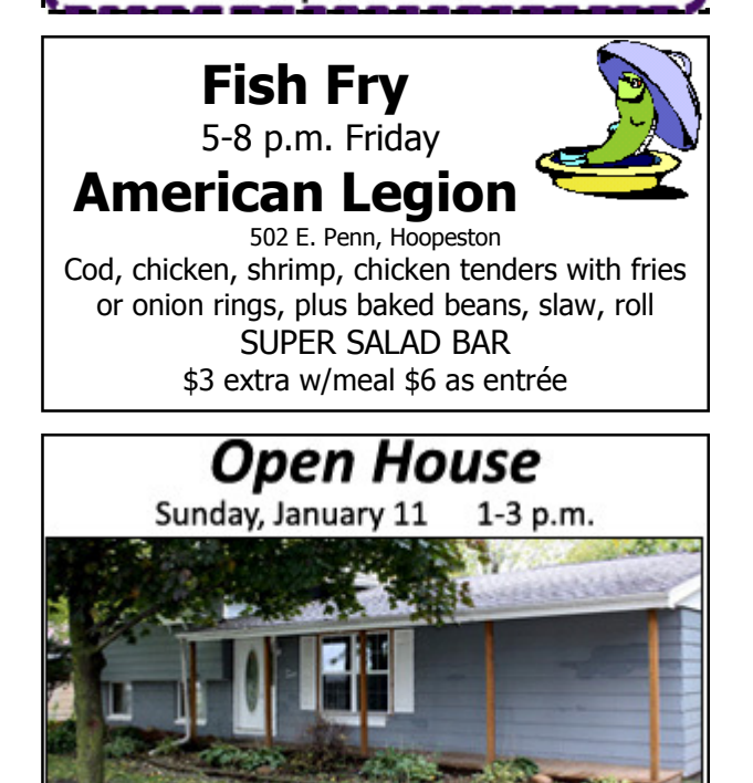
214 E. Wyman Ave., Hoopeston 3 bedroom 2 bath $69,900 Sumer Horton

olicitation. All information deemed reliable but not guaranteed