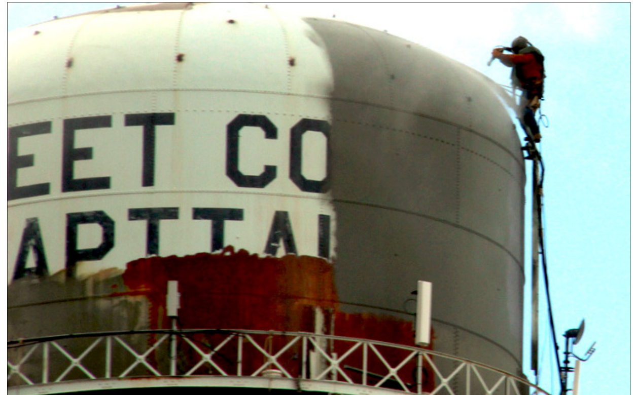
A worker sandblasts paint from Hoopeston's aerial water tower Monday.