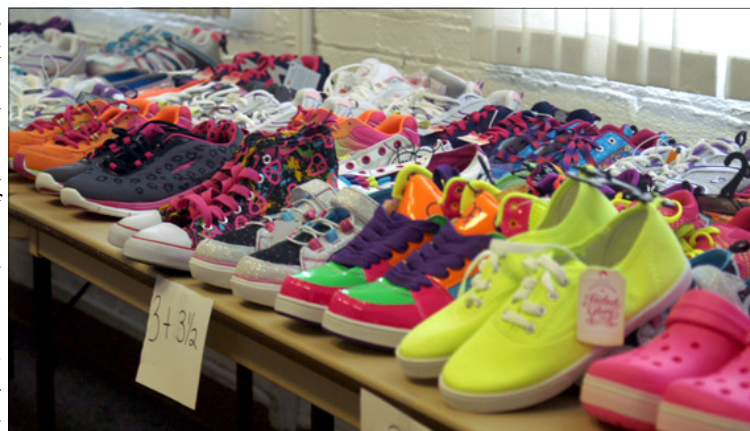
Just some of the shoes collected for Shoes for Little Souls. Shoes were distributed, along with school supplies, at Hoopeston Multi Agency.

From Prairie Green Church of Christ, it spread to other churches—including First Presbyterian Church and St. Anthony Catholic Church in Hoopeston—and medical facilities: surgery nurses and staff at Carle Hoopeston